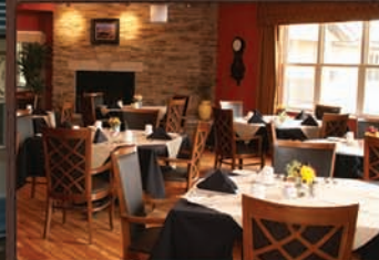
Intimate Dining Rooms